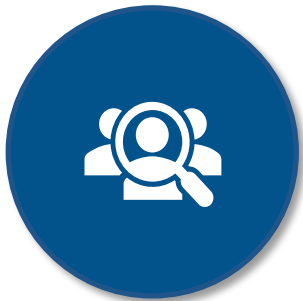
Network Research Hubs