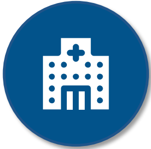
Clinical Science Center

Infrastructure components anticipated to be piloted and implemented