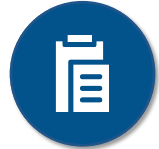
Independent Review and Monitoring Boards