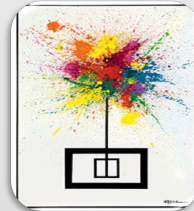
Transformative Research Award