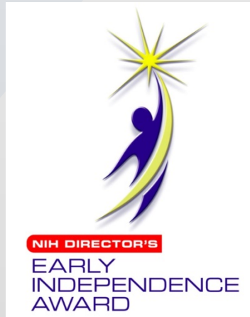
Early Independence Award