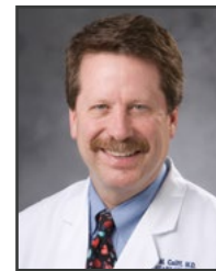
ROBERT CALIFF, M.D.